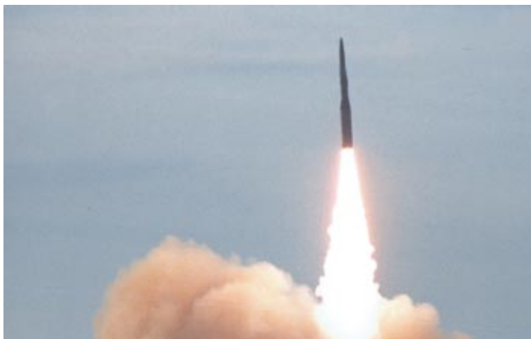
Intercontinental ballistic missile systems are able to strike quickly once the decision to employ nuclear weapons has been made.