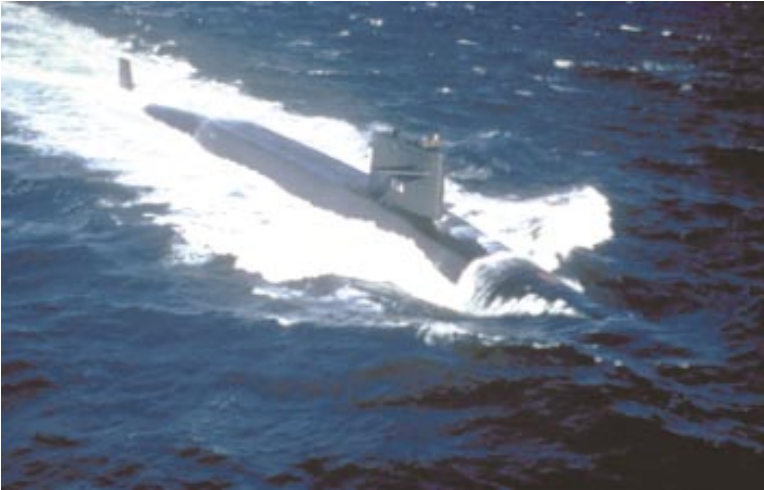
Sea-launched ballistic missiles deter potential aggressors from initiating an attack and remain deployed and ready should deterrence fail.

b. Strategy. Credible and capable nuclear forces are essential for national security. During World War II, nuclear weapons were instrumental in ending the war on terms favorable to the allies. The US postwar strategy has been one of deterrence, and nuclear forces have been developed,