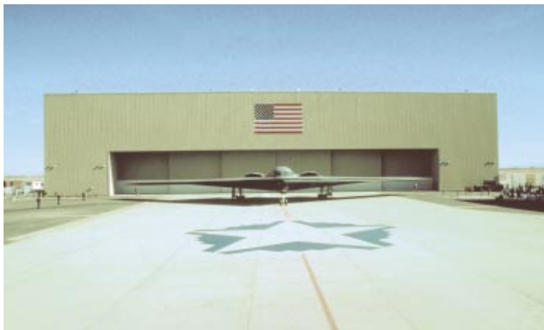
The bomber leg of the strategic Triad provides a flexible and recallable nuclear capability, which is essential in escalation management.

strategic force posture by eliminating intermediate retaliatory steps, there may be a rapid escalation. The ability to precisely gauge the attrition of conventional and nuclear forces will directly effect calculations on the termination of war and the escalation to nuclear war.