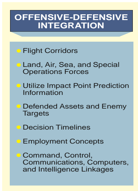
Figure III-4. Offensive-Defensive Integration

launch sites and defense intercept areas. This planning should include using alternate landing sites (in case the primary runway is under attack during the return flight) and (when friendly defenses are active) immediately identifying and transmitting ingress and egress routes. These routes should avoid areas scanned by defenses to reduce potential execution against friendly aircraft.