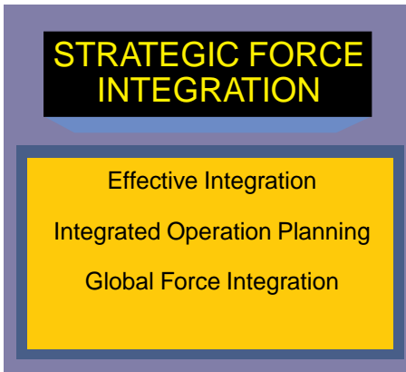
Figure III-1. Strategic Force Integration