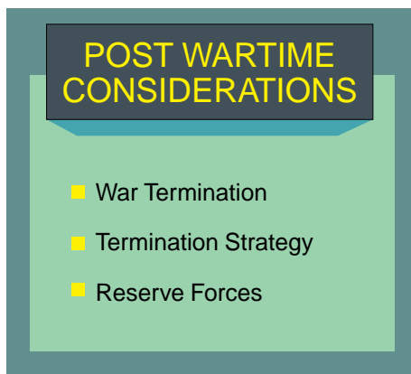
Figure I-3. Post Wartime Considerations