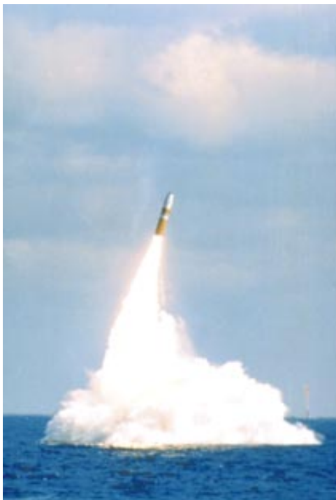
Sea-launched ballistic missiles provide an effective, survivable capability for the purpose of deterring large-scale aggression against the United States and its allies.

capable of striking these targets within the brief time available. Responsiveness (measured as the interval between the decision to strike a specific target and detonation of a weapon over that target) is critical to ensure engaging some emerging targets.