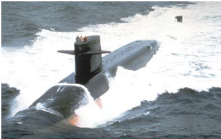
Each leg of the Triad brings a unique set of characteristics to be integrated with the other two, thus forming an effective strategic force.

important is consideration of the effect of enemy defense capabilities and limitations.