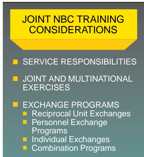
Figure VI-1. Joint NBC Training Considerations

a. Service Responsibilities. Each Service will incorporate NBC defense training into its overall training plan for units and individuals. This training should not only