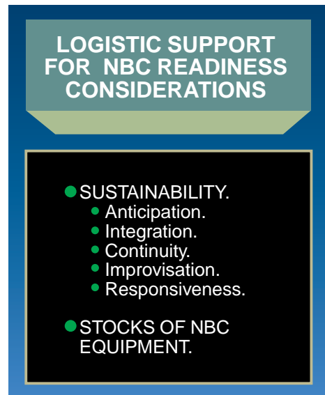
Figure IV-1. Logistic Support for NBC Readiness Considerations

c. Logistic Support for NBC Readiness. Logistics in an environment in which NBC warfare is anticipated must be considered from the aspect of the overall logistics effort under NBC conditions and logistic sustainment of the NBC defense effort itself. Adequate logistic support is vital to all combat operations, which must continue under all conditions. When developing a plan, the combatant commander balances requirements against limited resources. The challenge is to accomplish the mission with assets available. Logistical considerations, shown in Figure IV-1, often drive the COA open to a commander.