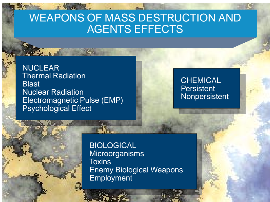
Figure II-1. Weapons of Mass Destruction and Agents Effects

This section describes the lethality and range of effects of weapons and agents in an NBC environment. Figure II-1 illustrates these effects.