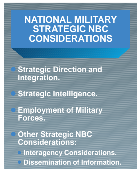
Figure I-2. National Military Strategic NBC Considerations

a. Strategic Direction and Integration. This guidance is expressed through revised national (and alliance) military strategy, derived from national security