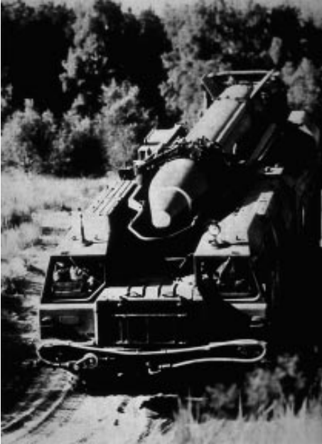
The proliferation of the Soviet-made SCUD missile system has increased the likelihood that joint forces, when deployed, will be required to fight in an NBC environment.