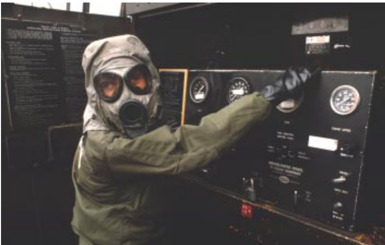
Joint force troops conducting maintenance operations in an NBC environment.

combatant commander must plan for logistic support operations for joint NBC defense. The combatant commander should cover all these aspects of logistic support in the portions of campaign plans and orders that address NBC defense in the theater.