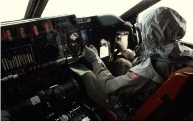
Operations in an NBC environment require that aircrews be fully experienced in accomplishing their mission while using Chemical Protective Clothing and Equipment.

respirator provides virtually complete protection against a biological aerosol attack. Effective respirator filters will remove any biological aerosol particles that are present in the air and will protect against all known weaponized chemical agents. (4) Use of Improvised Refuges. The term “improvised refuge” is used to describe systems that offer only limited protection and can be created even when a supply of filtered air is not available. The simplest form of improvised refuge is a room or space with the doors and windows that can be closed off . Further benefit can be obtained by using a space within a space . Thus, inner rooms of buildings provide better protection than outer rooms, especially if the opening is toward the lee side of the building. Further protection can be achieved if doors, windows, and other openings can be sealed , but this may seriously reduce the habitability of the space.