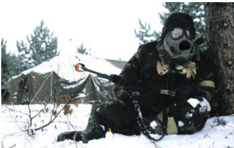
Exchange Programs include joint and multinational training in NBC tactics, techniques, and procedures to provide joint commanders greater flexibility in the application of forces.

comparable to preclude exchanging fully trained US forces for untrained HN forces.