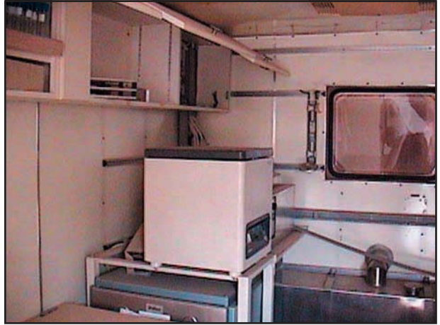
Interior view of mobile laboratory.