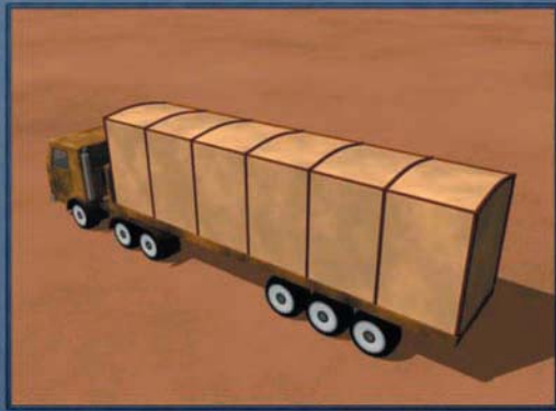
Exterior graphic from Secretary Powell's speech to the United Nations.