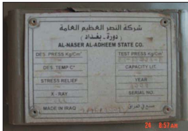
Manufacturer's data plate on the fermentor.

Some coalition analysts assess that the trailer found in late April could be used for bioproduction but believe it may be a newer prototype because the layout is not entirely identical to what the source described.