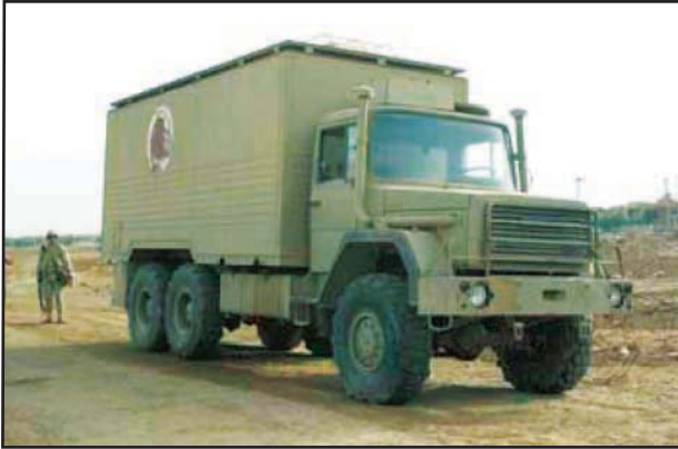
Iraqi mobile laboratory.