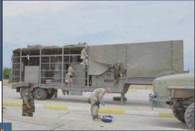
Exterior photograph of a probable mobile BW production plant found near Mosul, Iraq, in late April.