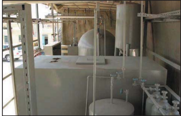
Interior view of fermentor, media tank, water supply tanks, and gas cylinders connected by pipes.

Common elements between the source's description and the trailers include a control panel, fermentor, water tank, holding tank, and two sets of gas cylinders. One set of gas cylinders was reported to provide clean gases—oxygen and nitrogen—for production, and the other set captured exhaust gases, concealing signatures of BW agent production.